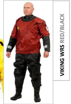
VIKING WRS RED/BLACK