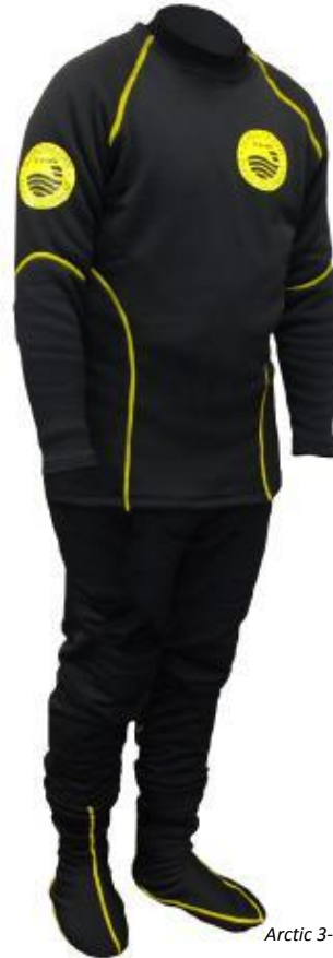
Arctic 3-Piece Undergarment

Each set comes complete with top, leggings, removable crotch strap and socks, all delivered in a Viking carry-bag. The Viking Arctic 3-piece will keep you warm and comfortable in waters down to around 40°F.