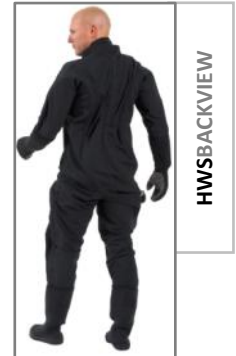
HOT WATER SUIT