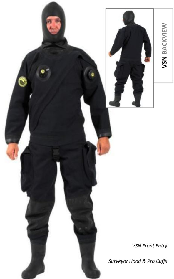
VSN Front Entry

Available in Wide and Doublewide Please refer to Viking Size Chart on our website for more information.