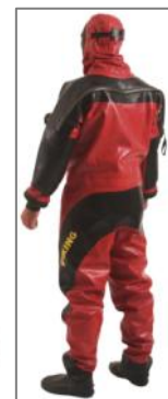
VIKING PRO BACKVIEW