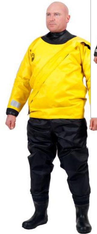
WRS – Yellow/Black

Available in Wide and Doublewide Please refer to Viking Size Chart on our website for more information.