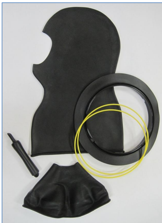
COMPLETE Q-C NECK RING SYSTEM, INCLUDING LATEX HOOD, NECK-SEAL AND INSTALLATION TOOL.

NOTE: THIS ASSEMBLY HAS NOT BEEN TESTED OR APPROVED FOR CONTAMINATED WATER DIVING SITUATIONS.