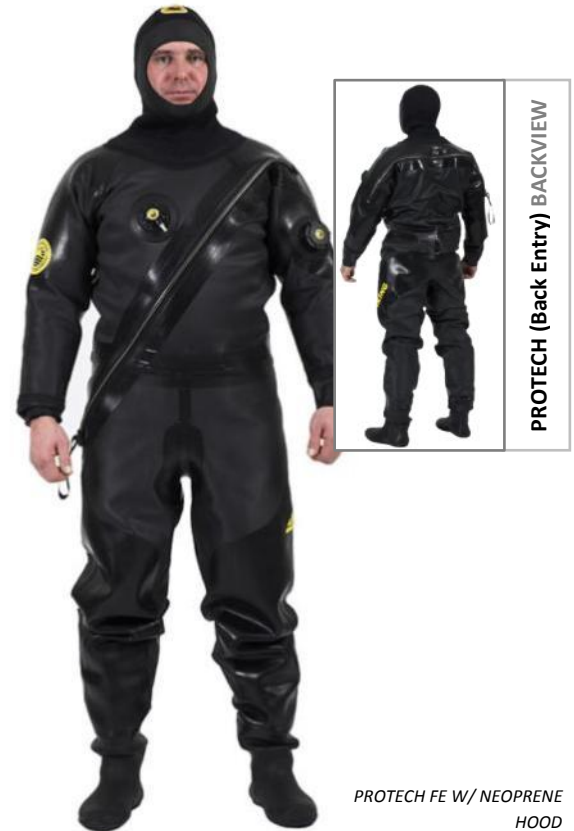
PROTECH FE W/ NEOPRENE HOOD